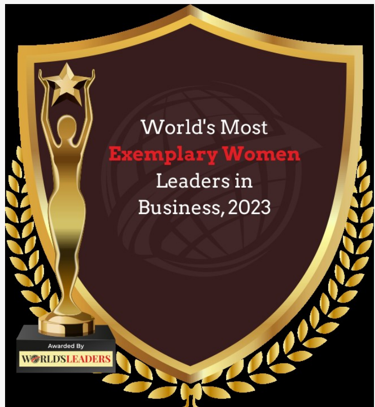
World's Most Exemplary Women Leader In Business, 2023