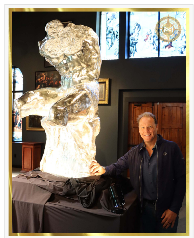
Belvedere Torso Sculpture in Pure Silver and Mark Russo

The world-famous sculpture has been cast and created as a posthumous original numbered #1/1 in the world. The silver piece was cast from the red wax poured directly into the plaster mold that was made in 1932 directly off the marble