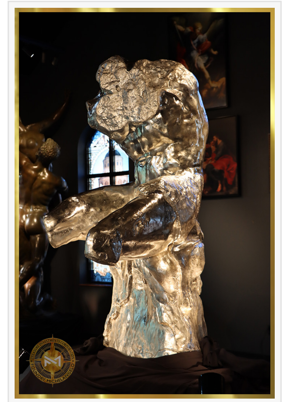
Belvedere Torso Sculpture in Pure Silver

The statue is documented in the collection of Cardinal Prospero Colonna at his family's palazzo in Monte Cavallo, Rome, from 1433. Between 1530 and 1536, the sculpture was acquired by the pope. How it entered the Vatican collections is uncertain, but by the mid-16th