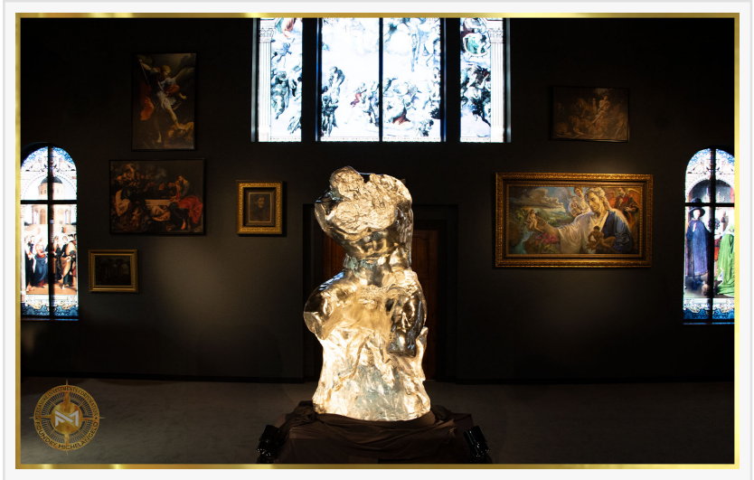
Belvedere Torso Sculpture in Pure Silver standing at Museo Michelangelo in Battle Ground, WA