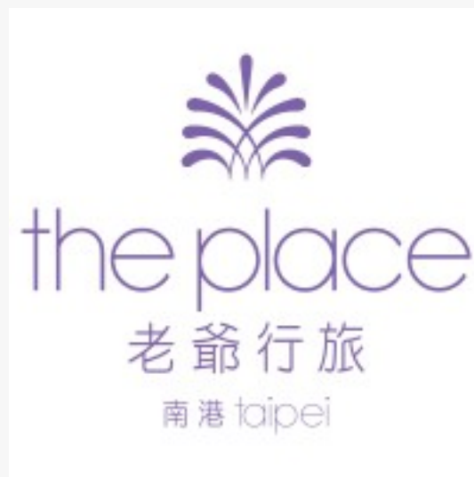
The Place Taipei

This press release can be viewed online at: https://www.einpresswire.com/article/656060981