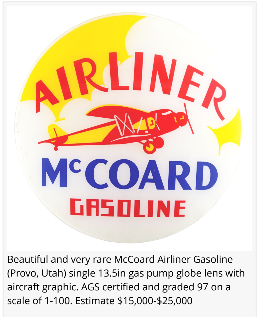
Beautiful and very rare McCoard Airliner Gasoline (Provo, Utah) single 13.5in gas pump globe lens with aircraft graphic. AGS certified and graded 97 on a scale of 1-100. Estimate $15,000-$25,000

For the home "service station" or man cave, Morphy's recommends a circa-1950s GulfLube oil rack complete with 11 GulfLube motor oil cans. All have their top and bottom lids and two of them still contain oil. As complete and nice as any collector could hope for, the rack has an overall excellent appearance and is graded 8.9++. Estimate: $2,000-$4,000