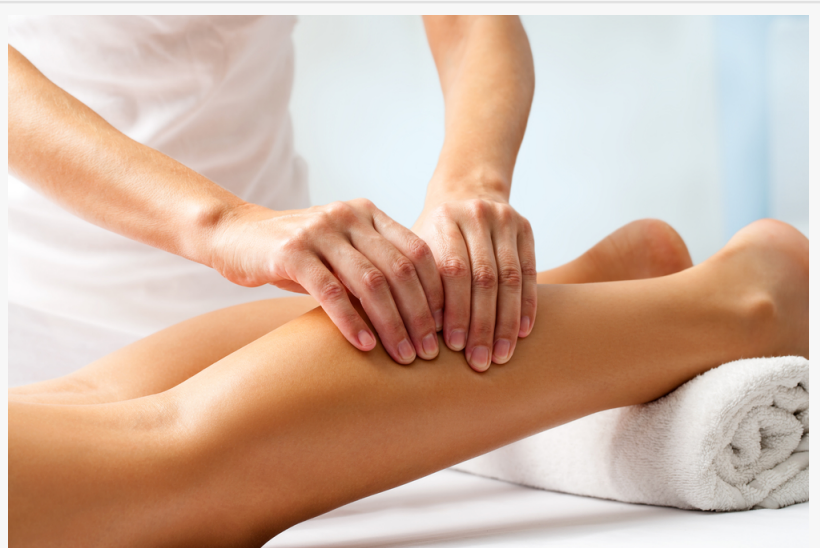
Primary care Rego Park Queens

What sets the Musculoskeletal Wellness Clinic apart is its undying commitment to patients. The clinic prides itself on its boutique clinical practice ethos, where doctors dedicate ample time to listen and understand each patient's concerns. This patient-