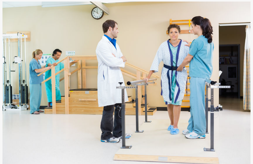
Primary care Forest Hills Queens