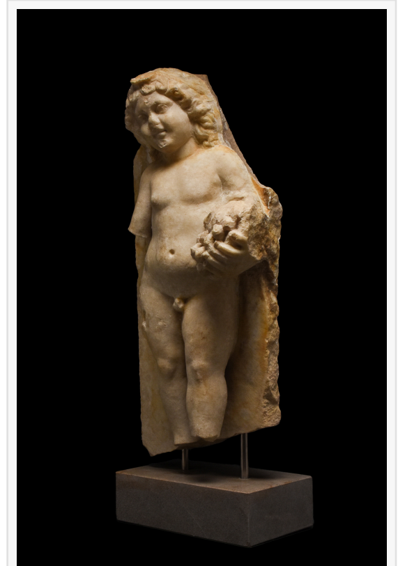
Roman marble figure of Cupid holding grapes, circa 200 AD, finely carved in extremely high relief. Height: 700mm (28in) inclusive of stand. Ex R. Sorge collection. Estimate: £10,000 -£15,000 ($12,490-$18,735)

Apollo Art Auctions' Sept. 24, 2023 sale will start at 7 a.m. US Eastern Time/12 noon GMT. View the fully illustrated auction catalogue and sign up to bid absentee or live online through LiveAuctioneers. The company accepts payments in GBP, USD and EUR; and ships worldwide. All packing is handled by white-glove specialists in-house. Questions: Tel. +44 7424 994167 or email info@apollogalleries.com . Online: www.apolloauctions.com