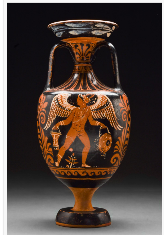
Apulian red-figure decorated amphora, Magna Graecia, 4th century BC. Estimate: £6,000-£9,000 ($7,490-$11,340)

A top prize is the circa 200AD Roman marble figure of Cupid (Eros) holding a large bunch of harvested grapes. Finely carved in the round and in extremely high relief, it showcases the artist's great skill at translating human anatomy to stone. On its stand, the figure's height is 700mm (28in), with a weight of 37.35kg (82lbs 5oz). Provenance includes several British and Continental galleries and collections, including that of R. Sorge (1980s, Germany). The pre-sale estimate is £10,000 -£15,000 ($12,490-$18,735).