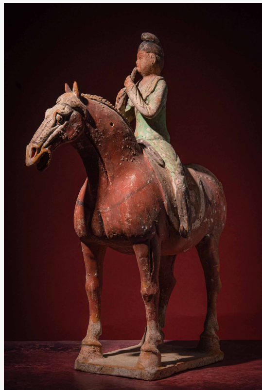
Chinese Tang Dynasty terracotta rider on horse, circa 618-907 AD. Size: 440mm x 380mm (17.3in x 15in). Precisely dated by TL analysis. Estimate: £4,000-£6,000 ($4,995-$7,490)