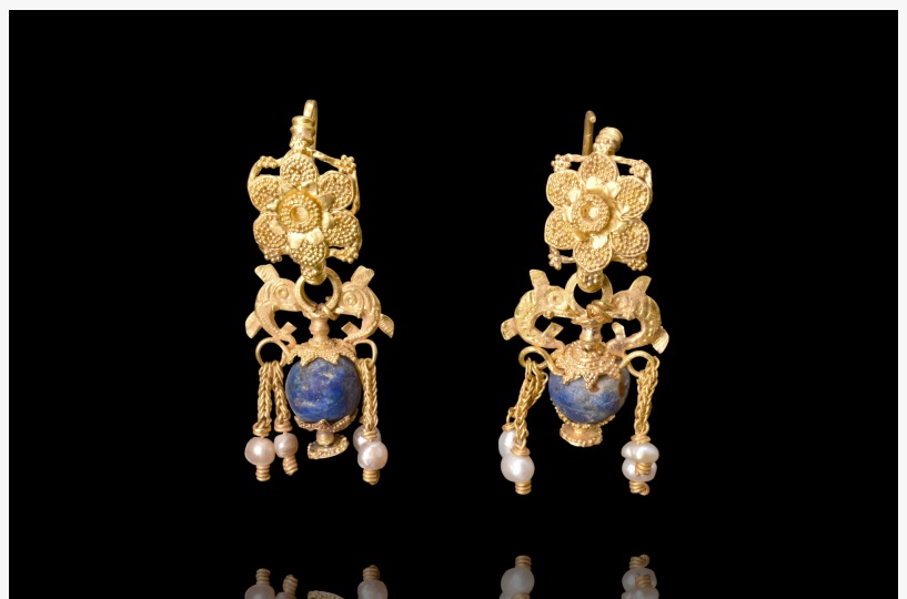
Circa 4th century BC Greek Hellenistic gold filigree and lapis lazuli earrings incorporating two graceful dolphins. Estimate: £3,000-£6,000 ($3,745-$7,490)

A circa 500-400 BC gold ring with a lozenge-shape bezel engraved with a detailed image of a bull