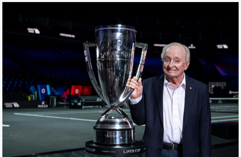
ROLEX TESTIMONEE ROD LAVER WITH THE TROPHY AT THE 2022 LAVER CUP IN LONDON