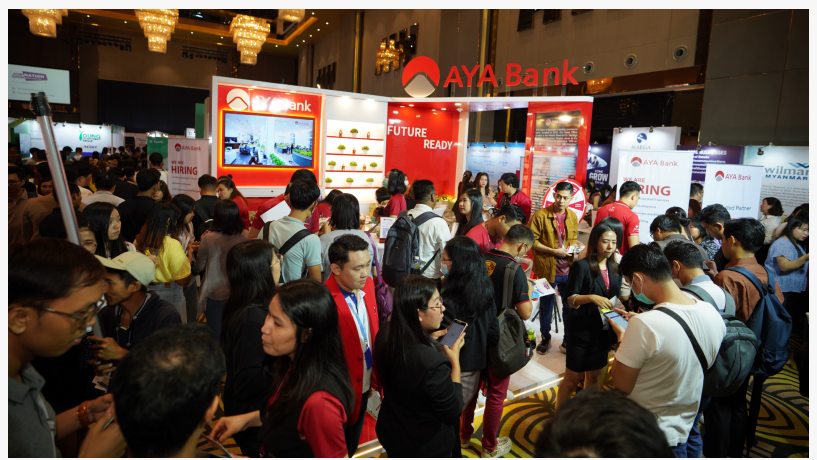
A crowd of Job Seekers in attendance at JobNet JobNation

We eagerly anticipate bringing JobNATION to Mandalay this November."