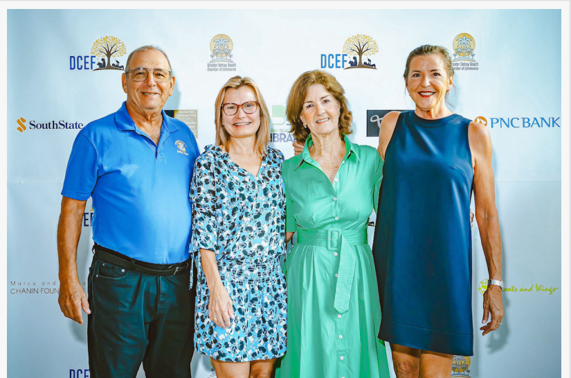
Square Off the Square Board Members

Furthermore, DCEF is excited to announce an ongoing campaign aimed at supporting the teachers in these schools. The DCEF has established a wish list of essential items, available on their website, DelrayEducation.org , to ensure Delray's hardest working educators have the resources they need to nurture the minds of the community's future leaders.