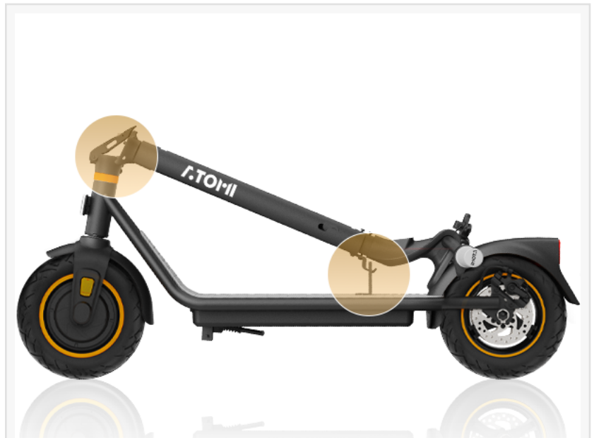
Atomi E30 folded

"Atomi strives for excellence in every category of the personal transportation space, and the new E30 electric scooter fulfills a small but fairly important gap in our essentials series. With this new micro-mobility solution, we are introducing electric scooter fans to competitively-priced electric scooters with 10-inch shock-absorbing pneumatic tires," said Carol Young, co-founder of Atomi. "Even though the new model comes with an attractive price tag, our unique positioning on the market allows us to build Atomi E30 with some of the finest components on the market."