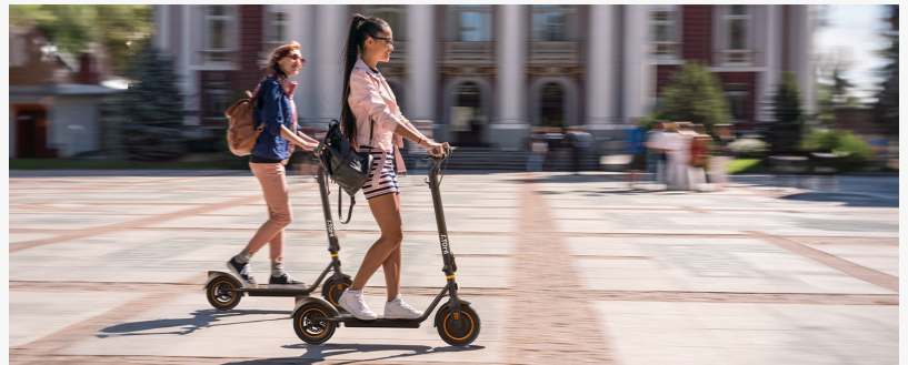
Atomy E30 Lifestyle

Atomi E30 will be available in an elegant black color. The micro-mobility expert plans to offer the usual free next-business-day shipping with delivery in 5-8 business days. Atomi will also accept returns on unused scooters within 14 days of delivery and provide an industry-standard 12-month warranty.