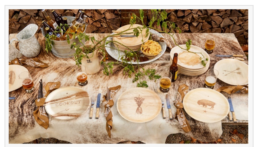
A selection of maaterra's elegant, compostable, single-use plates.

LYME, CT, UNITED STATES, September 18, 2023 /EINPresswire.com/ -- How do you entertain in style while staying true to your values? <a href="mailto:maaterra">maaterra</a>, a womanowned brand based in Lyme, Connecticut, was founded with a vision to eliminate compromise between design and sustainability. The new line of compostable tableware, a brand launched by NEATGOODS, LLC in Lyme,