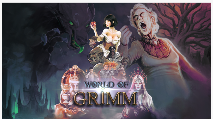
World of Grimm Box Art

Every Match Is Different: With over 30 unique realms to explore, "World of Grimm" offers endless variety and excitement. Will you discover the hidden treasures of Simeli Mountain or outwit your opponents in the eerie Graveyard?