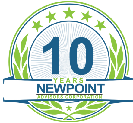
Newpoint Advisors Corporation 10 year anniversary logo