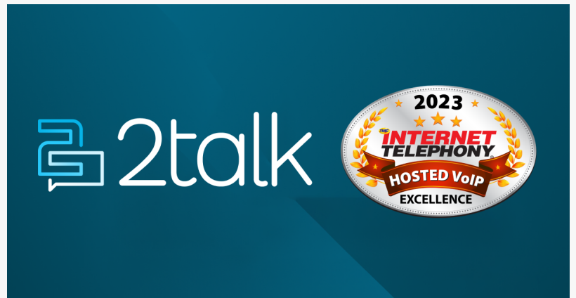
2talk LLC Awarded 2023 INTERNET TELEPHONY Hosted VoIP Excellence Award

The 2023 INTERNET TELEPHONY Hosted VoIP Excellence Award winners will be published on INTERNET TELEPHONY magazine online.