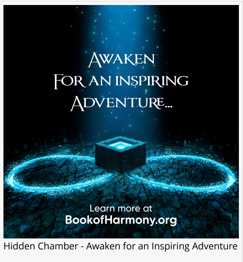
Hidden Chamber - Awaken for an Inspiring Adventure