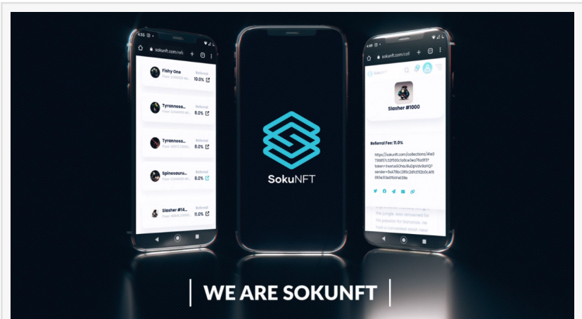
We Are SokuNFT

The proceeds from the Series A funding round will be used to expand SokuNFT's team,