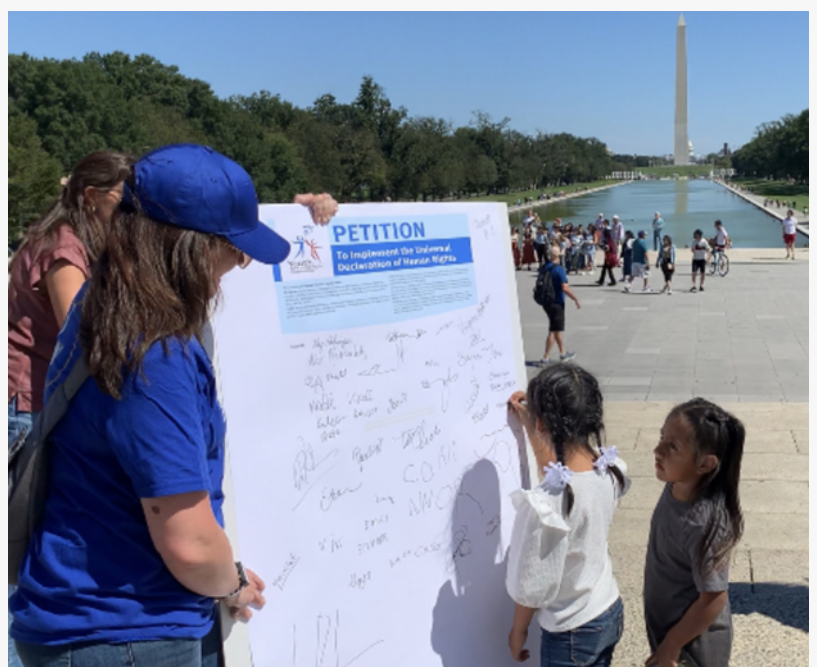
Youngsters sign a petition to require human rights education in the curriculum in US schools

The walk was led by Youth for Human Rights International's DC Chapter in honor of the