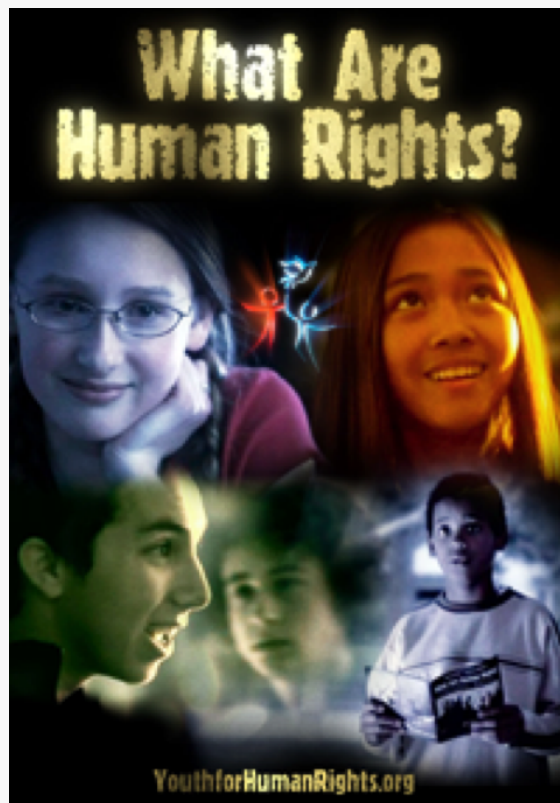
"What Are Human Rights?" educational booklet provided free of charge by Youth for Human Rights International