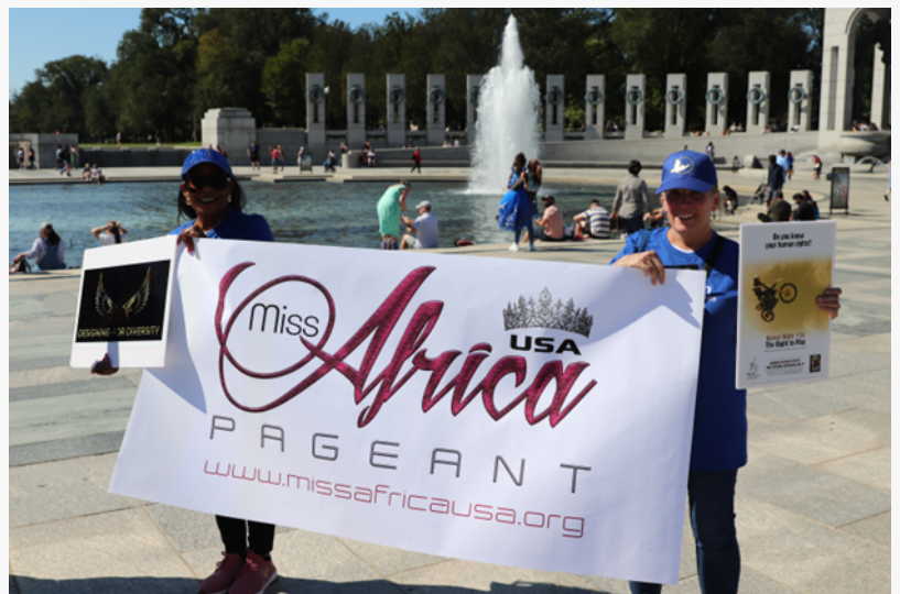
Miss Africa USA at the World War II Memorial promoting human rights

Youth for Human Rights International (YHRI) is a nonprofit organization with chapters around the