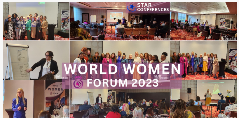
World Women Forum 2023 Paris, France hosted by Star-Icon Conferences. Global speaking tour uniting 70+ inspirational game changing thought leaders.