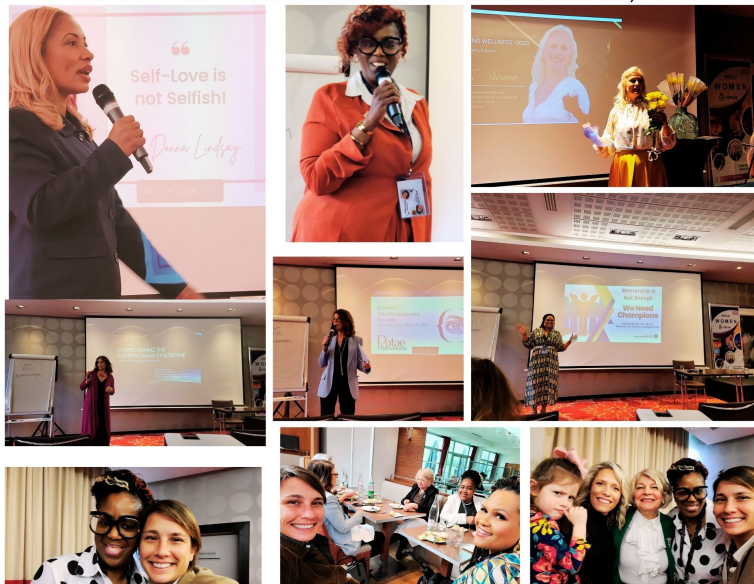
www.socialgoodmagazine.com

Star Icon World Women Forum 2023 in Paris, France shared messages of hope and inspiration for solutions for global peace with 70+ thought leaders.