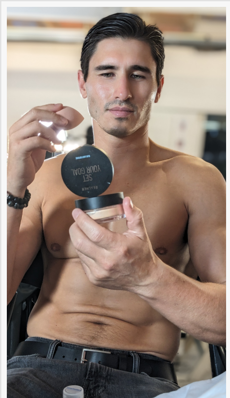
Model with Blurring Veil Powder

New York Fashion Week 2023 attendees can look forward to witnessing stunning makeup looks