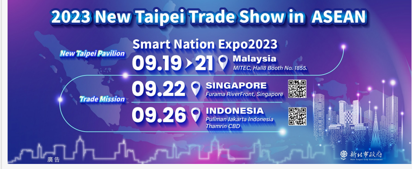
Trade Mission Schedule

Southeast Asia, centered around the theme of "Connecting Smart Innovations," while covering diverse applications such as Smart City, Industry 4.0, and other new technologies. Last year, the event attracted over 14,000 overseas buyers from over 50 countries, with participation from 12 national pavilions including Malaysia, Singapore, the UK, the Netherlands, Belgium, Australia, Spain, the US, Japan, South Korea, Taiwan, and China. Due to the digital wave sparked by the 11th Malaysia Plan from 2016 to 2020, this exhibition serves as a primary platform for foreign enterprises to gain exposure in Malaysia, which is a major reason why the New Taipei City Government's Economic Development Department is leading a delegation to this year's event.