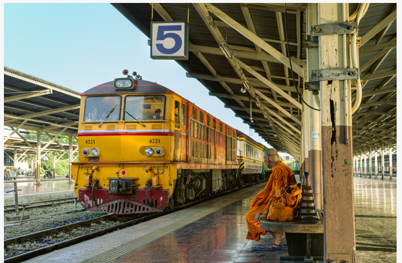
A Train Arriving at Hualamphong