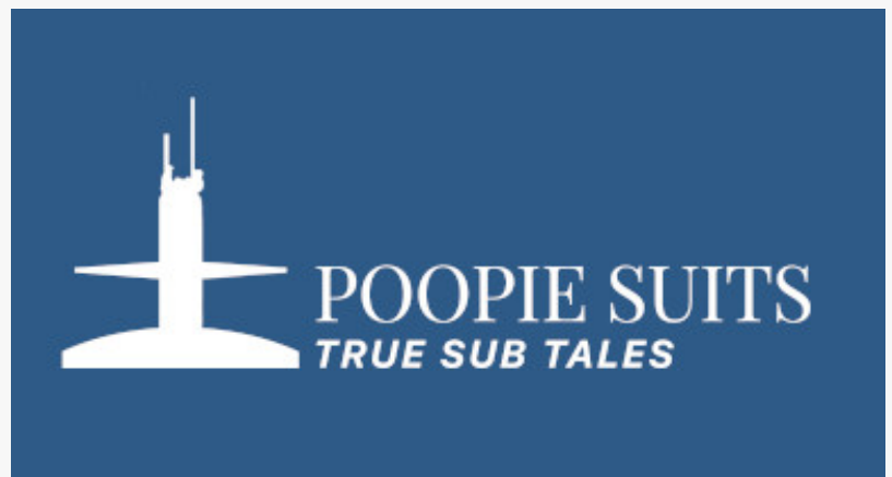
Poopie Suits Series Logo

Specific topics addressed in Sub Tales 4 include the inspiring life story of Charles Lockwood, a key figure in US submarine success during World War II; the serendipitous role of the