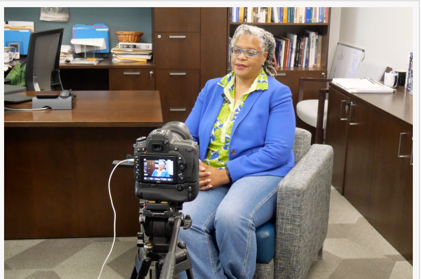
Are You A Librarian: The Untold Story of Black Librarians

UNITED STATES, September 19, 2023 /EINPresswire.com/ -- Amidst the rising challenges of book banning and censorship, a documentary is set to shed light on the contributions of Black Librarians who stand on the front lines, ensuring equitable access to knowledge for all. Titled 'Are You a Librarian: The Untold Story of Black Librarians', this eagerly anticipated documentary is scheduled for release at the top of 2025. The production promises to captivate audiences with a narrative that unveils the often-overlooked role of Black librarians in shaping our collective understanding of the world.