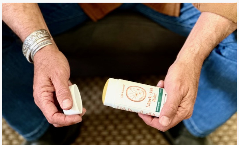
Life Elements CBD Muscle & Joint Relief Stick

Professional Strength Muscle & Joint Relief is available in the following dosages for use safely and as directed: