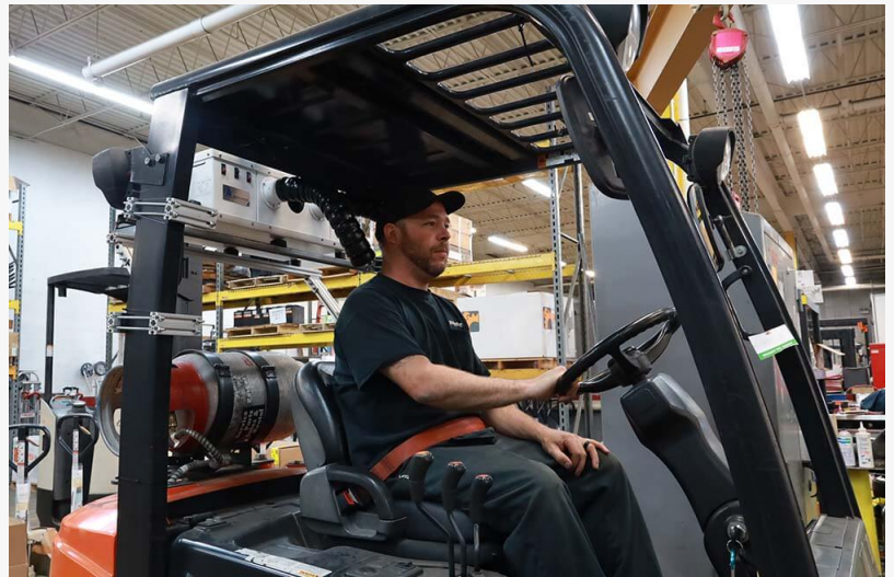
Cabin Cool Unit on Forklift