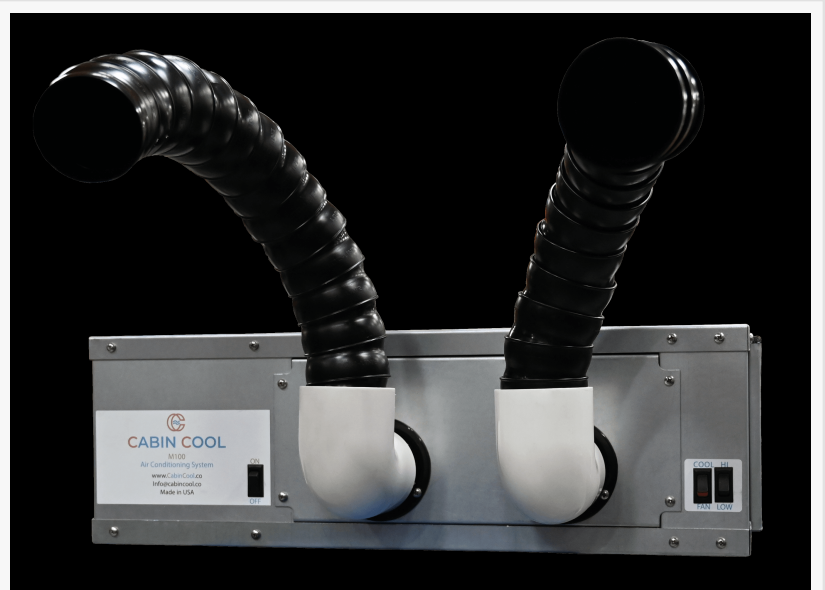
Cabin Cool System

With this product, Air Innovations aims to help keep forklift drivers comfortable and jobsites safer. Warehouse and outdoor work environments can foster extremely hot and humid conditions. This can leave forklift drivers exhausted and weary while moving cargo, endangering themselves and others. Through the Cabin Cool System, factories across the United States can create better working conditions and keep their employees safer, more comfortable, and more productive.