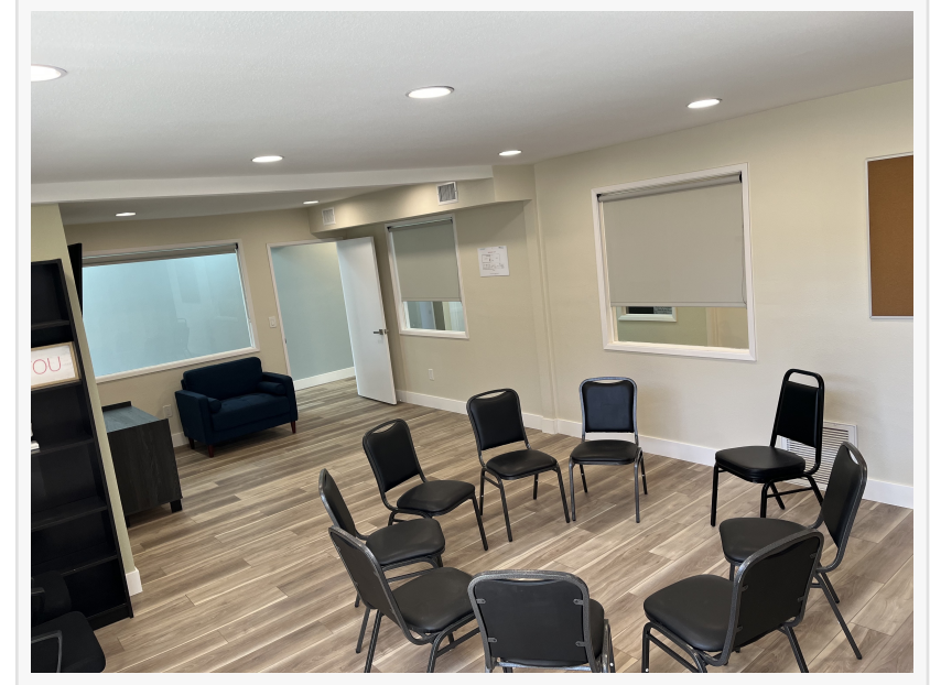
Outpatient Treatment San Diego

This press release can be viewed online at: https://www.einpresswire.com/article/656398560