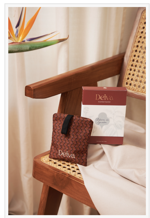
A seamless blend of freedom and joy: Presenting 'Bloom on Equator' .

The 'Colors of Life' campaign, accompanying the fragrance's launch portrays the myriad hues of life, each shade representing a unique emotion, experience, or memory. This campaign is a vivid reminder of nature's lush and vibrant palette, with colors that evoke feelings, tell stories, and rekindle memories.