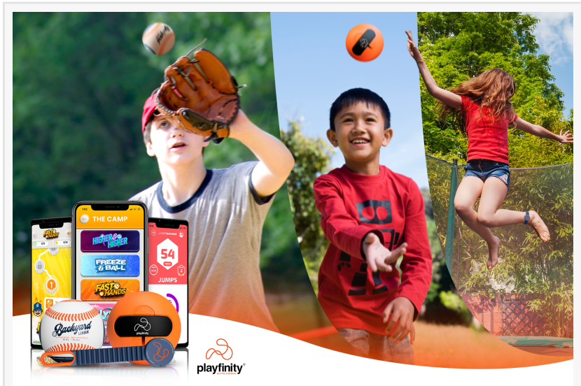
Active Gaming: Playfinity use technology for good: to inspire better habits

Playfinity is the home of Active Gaming. They are a Norwegian sports-tech company on a mission to create a more active future for kids. Playfinity develops products, technology, and experiences that inspire, motivate, and connect children, coaches, parents, families, friends, and teammates around the world, providing new ways to discover, play, compete, and have fun together based