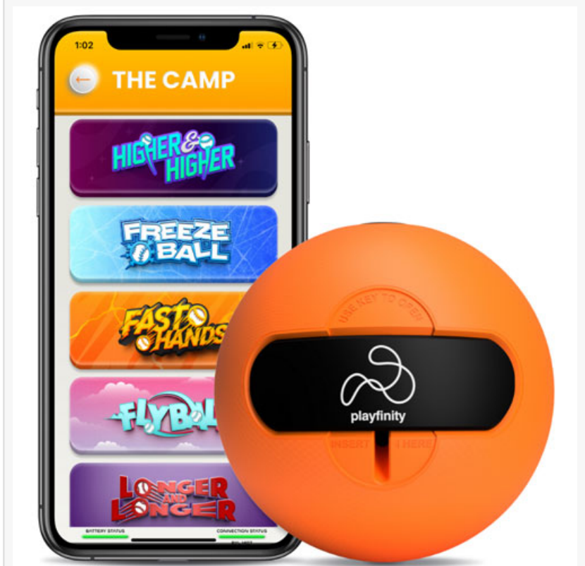
SmartBall: Soft and squishy design perfect for introducing little kids to all ball-throwing sports helping them gradually develop their skills while having a blast