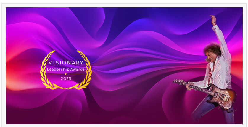
Visionary Leadership Awards graphic featuring Rock Star Domenick Allen from Foreigner

MINNEAPOLIS, MINNESOTA, UNITED STATES, September 19, 2023 /EINPresswire.com/ -- What was once news of an occasional data breach has become a daily barrage of security incident headlines. Compromised networks, stolen financial and intellectual property, and crippled