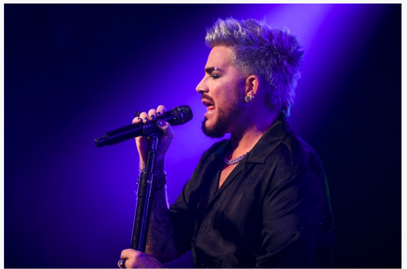
Adam Lambert

Proceeds from the weekend will support the Prostate Cancer Foundation's funding of the world's most promising cancer research, including PCF's Young Investigator program which has transformed how medical research is conducted over the past three decades. Discoveries by hundreds of PCF investigators at more than 220 institutions have driven breakthrough treatments in prostate and more than 70 other cancers.