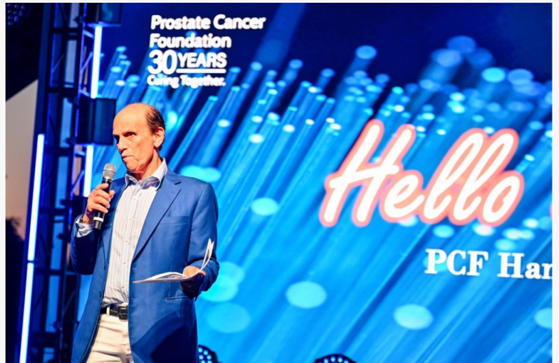
Michael Milken

The gala began with a lively cocktail reception as distinguished guests and athletes entered the breathtaking Parrish Art Museum terrace. Total Sponsorships and ticket sales were valued at $1.25 million. In addition to this, the live auction was swift, raising more than $5.6 million for the Foundation's work.