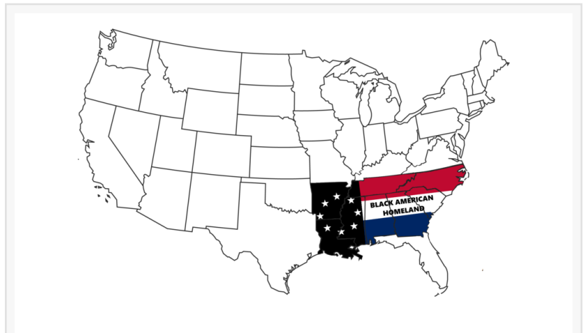
Black American Homeland Flag Map