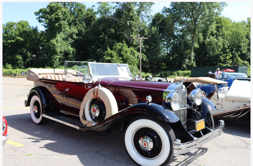
Timeless elegance meets fierce competition #ClassicCarShowdown