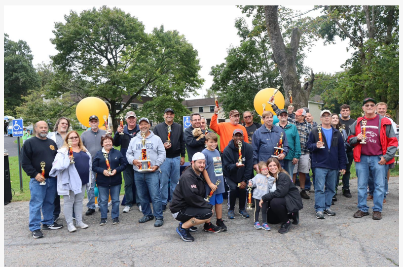
An impressive lineup of past car show winners celebrating their well-deserved victories