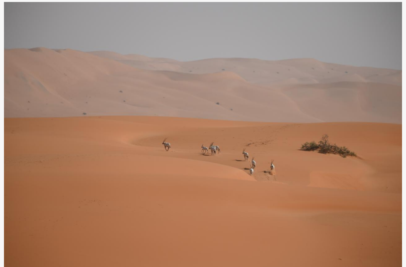
Saudi Arabia's Uruq Bani Ma'arid Protected Area.

The nomination was developed through a collaborative effort by the Saudi National Center for