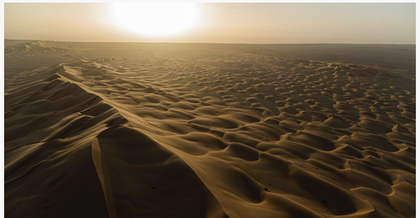
Saudi Arabia's Uruq Bani Ma'arid Protected Area.