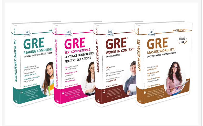
These titles are designed to give students in-depth practice of the GRE verbal reasoning section