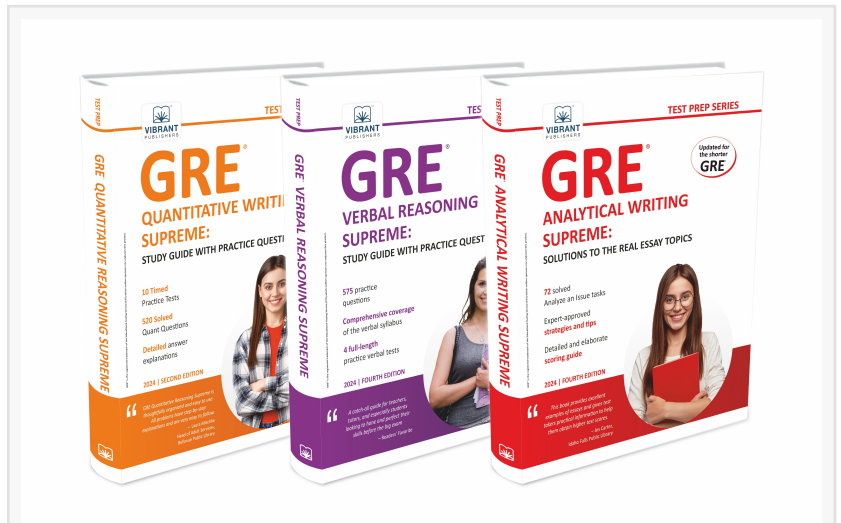
Vibrant's GRE Supreme books will help students master the analytical writing, verbal reasoning, and quantitative reasoning sections of the GRE.

The eight new editions that Vibrant released include GRE Analytical Writing: Solutions to the Real Essay Topics - Book 1, GRE Analytical Writing: Solutions to the Real Essay Topics - Book 2, GRE Reading Comprehension: Detailed Solutions to 325 Questions, GRE Text Completion and Sentence Equivalence Practice Questions, GRE Master Wordlist: 1535 Words for Verbal Mastery, GRE Words In Context: The Complete List, GRE