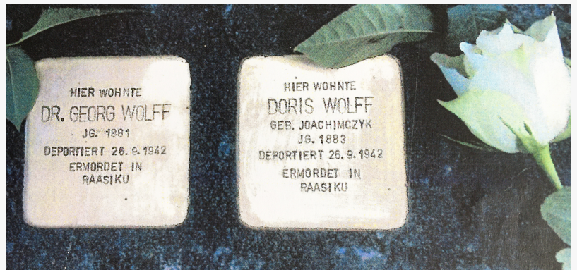
Stolpersteins in Berlin commemorating the author's grandparents