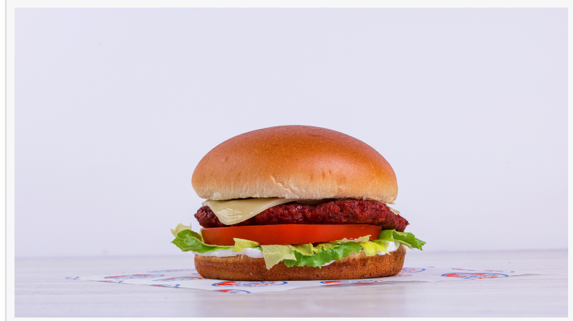
Barbar Soujok Burger

This press release can be viewed online at: https://www.einpresswire.com/article/656855503