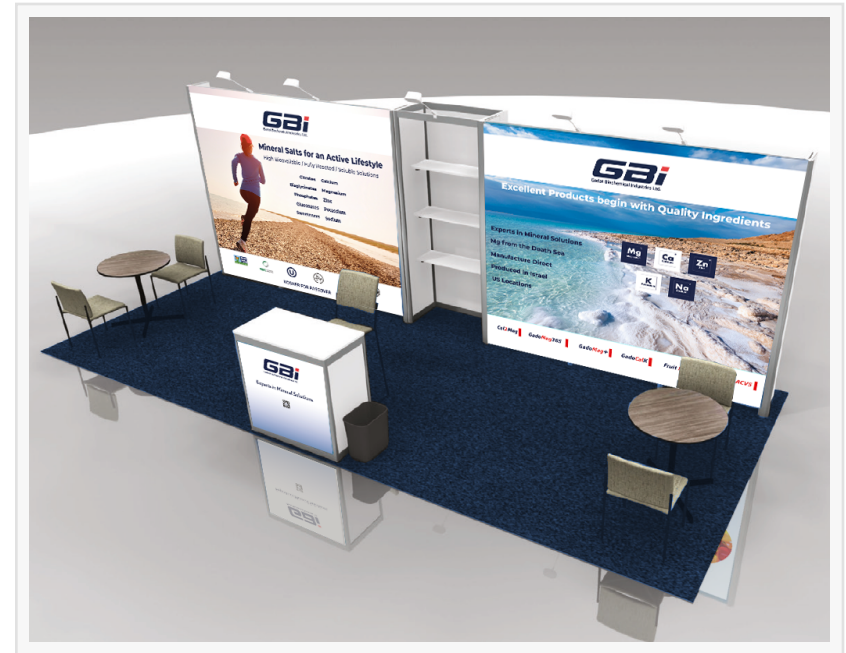
Gadot Booth 4486 in SSW 2023

SSW & Food Ingredients North America is a paramount event for the nutraceutical realm. It is a pivotal nexus for formulators, buyers, new product development teams, and marketers, offering an unrivaled platform to explore, innovate, and