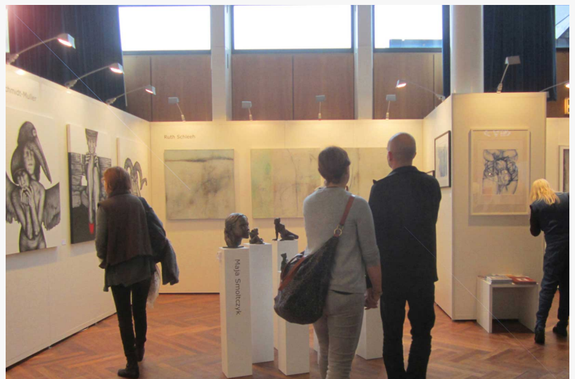
ART FAIR ZÜRICH - ART-ZÜRICH.COM