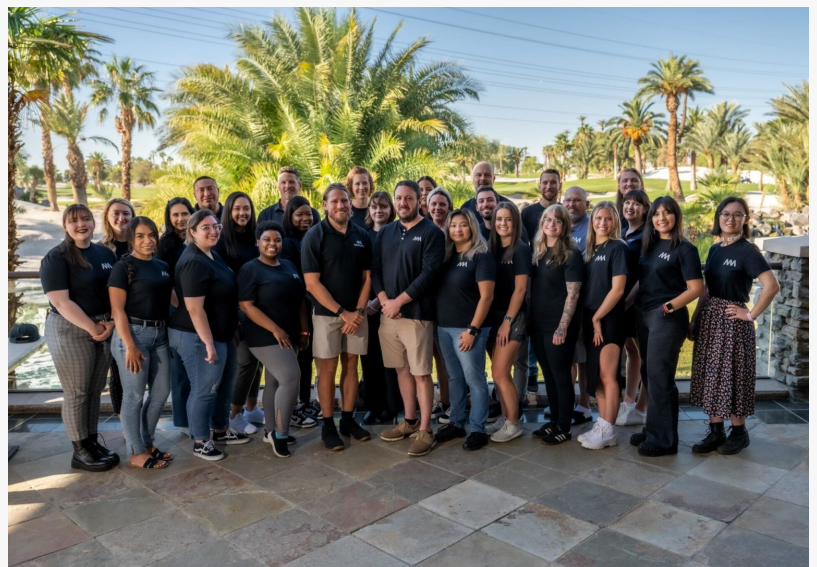
Market My Market Team