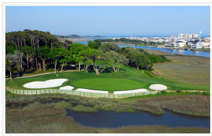
12 and 13 hole at Tidewater Golf Club

The Tidewater experience is highlighted by nine holes that play along either the Intracoastal Waterway