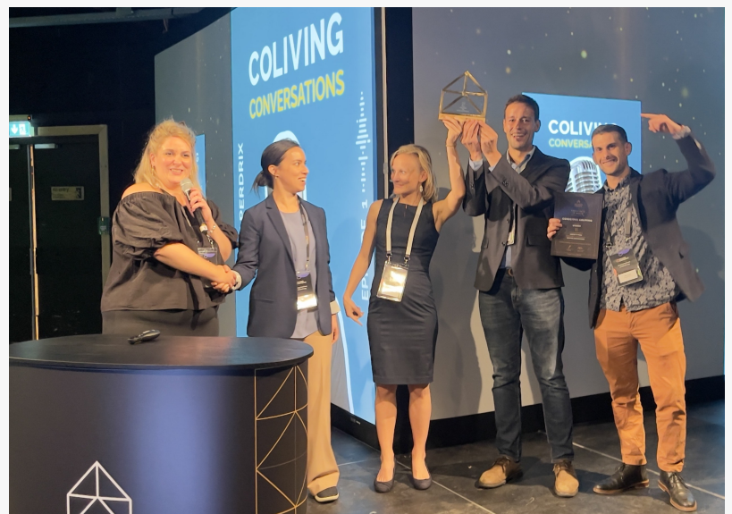
Coliving Conversations wins the 2023 Coliving Awards