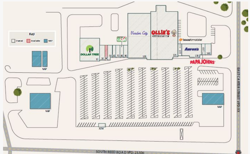
Availability: Kokomo Plaza