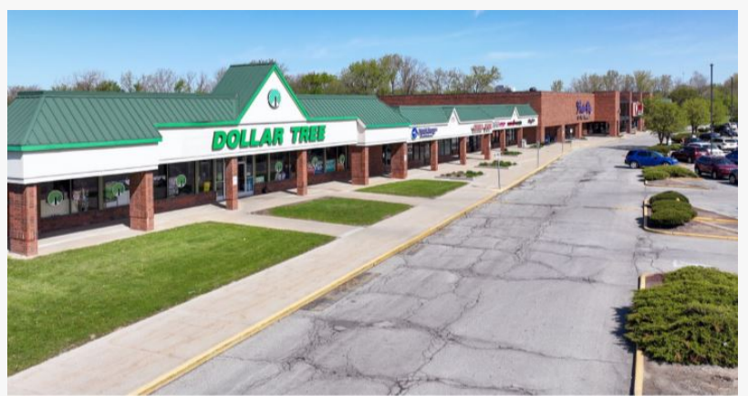
Kokomo Plaza Facade

KOKOMO, IN, USA , September 21, 2023 /EINPresswire.com/ -- Cre-Pro, LLC, and Infinite Equity Capital , LLC, are thrilled to announce their joint acquisition of Kokomo Plaza, located at 513 S Reed Rd, Kokomo, IN 46901. This strategic partnership marks a significant milestone for both companies, as they expand their real estate investment portfolios and contribute to the growth and development of the Kokomo community.