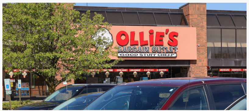
Ollie's at Kokomo Plaza