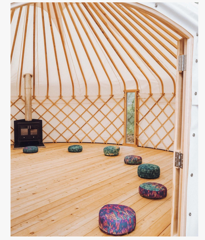
Relax in the 750-square-foot yoga yurt and Finnish saunas

As part of Concierge Auctions' Key for Key® giving program in partnership with Giveback Homes, the closing will result in the funding towards a new home built for a family in need.