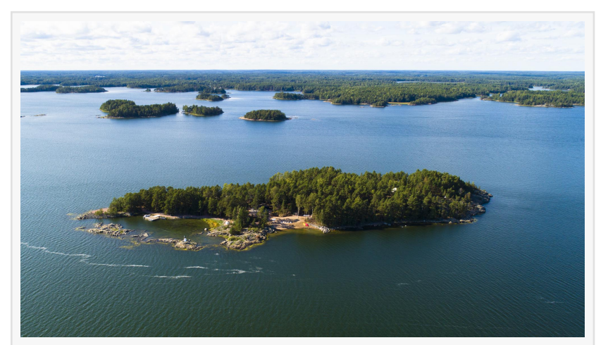
Super She Island | Raseborg, Near Helsinki, Finland

Discover SuperShe Island located in one of the world's largest archipelagos. Just off the coast of Finland, voted the world's happiest place six years in a row, this private island spans 8.47