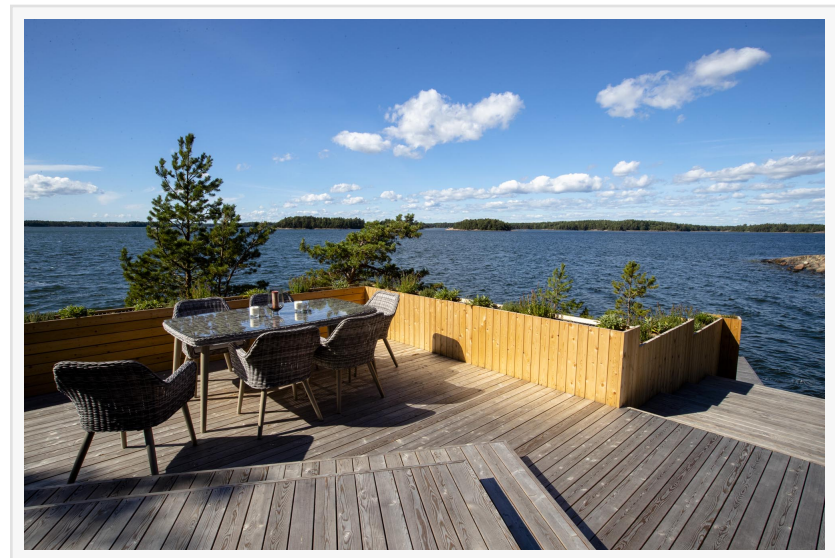
Potential for creative development and ample revenue growth

one-of-a-kind homes with some of the most capable property connoisseurs on the planet. Sellers gain unmatched reach, speed, and certainty. Buyers receive curated opportunities. Agents earn their commission in 30 days. Acquired by Sotheby's, the world's premier destination for fine art and luxury goods, and Anywhere Real Estate, Inc (NYSE: HOUS), the largest full-service residential real estate services company in the United States, Concierge Auctions continues to operate independently, partnering with real estate agents affiliated with many of the industry's leading brokerages to