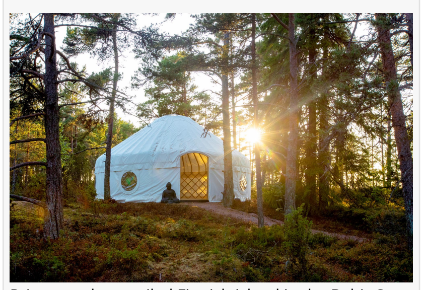
Private and unspoiled Finnish island in the Baltic Sea