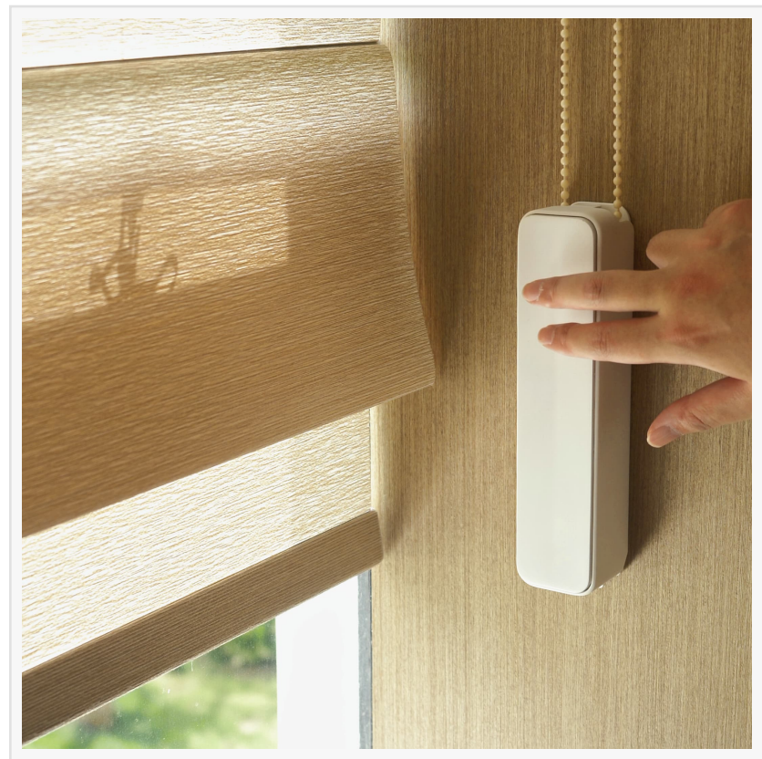
Arpobot Smart Shade X Roman Shade

The inception of Arpobot can be traced back to a moment of frustration during the COVID-19 lockdown. The founder, with a background in both mechanical and structural engineering from the University of Melbourne, found himself wrestling with the manual adjustment