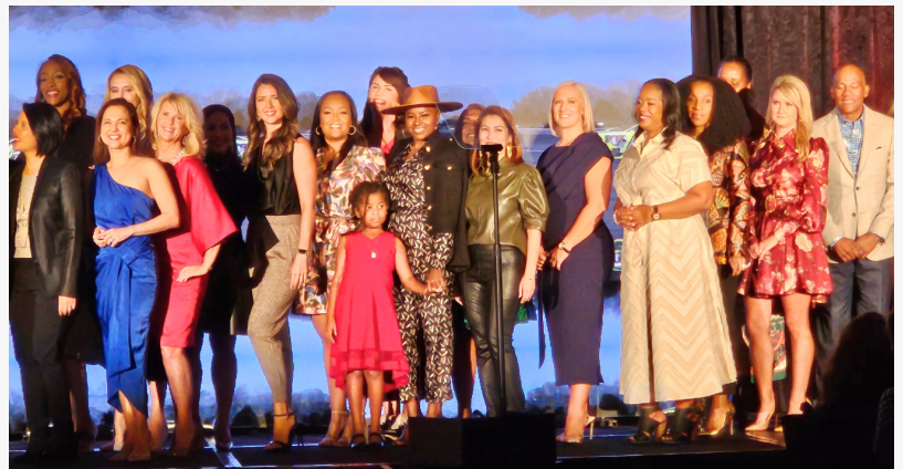
Role Models at the GHWCC Style Show Stage