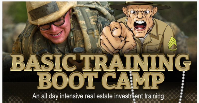
Boot camp banner