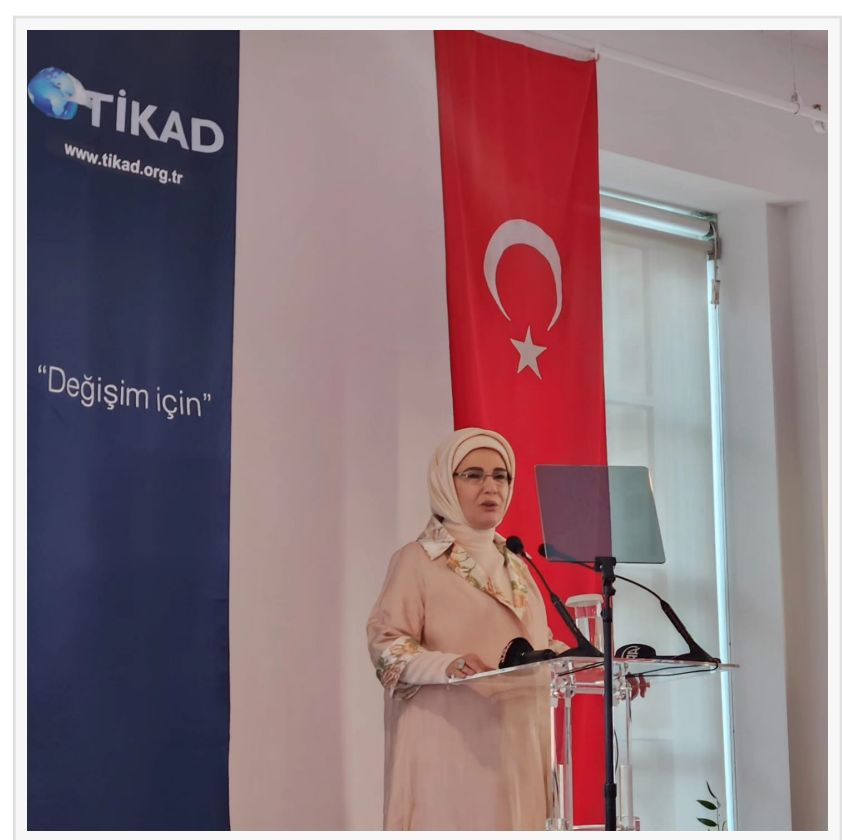
Mrs. Emine Erdoğan, First Lady of Türkiye

About TİKAD: Established in 2004, TİKAD's mission is to contribute to Türkiye's social and economic development and to explain Türkiye's modern face to the world; to create leading women in all fields, strengthen the presence of women in the business world, increase the influence of business women in public opinion and governments, and take responsibility in Türkiye's democratization process and integration with the modern world by bringing together businesswomen and working women with professional leadership.