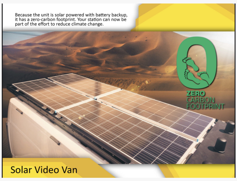
The nominee for "Product of the year 2023" by NAB was The Solar Van

The company employs a range of advanced technologies, including MultiDyne Silverback 4K/UHD fiber camera backs, an 8K ATEM Constellation switcher, and a NewBlue Fusion 4K title/graphics generator.