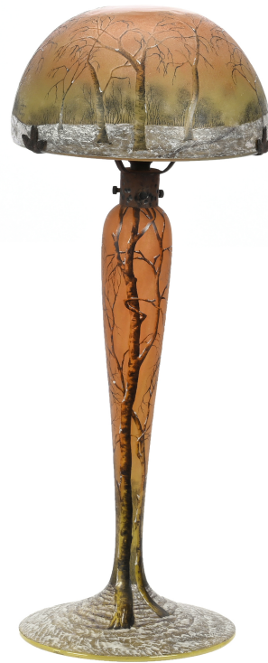
French cameo art glass table lamp signed Daum Nancy boasting a beautiful winter scene cameo cut and enamel décor, 18 inches tall with the original fittings (est. $8,000-$12,000).

Phone bidding is available for lots with a low estimate of $600 or greater (low estimates are found on LiveAuctioneers.com). Email your phone bid list to info@woodyauction.com by noon on Oct. 11; include your name, full address, a primary phone number, and a backup/secondary phone number. You will be notified that your phone bids were received. The BP is the same as absentee bids.