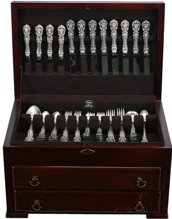
96-piece sterling silver flatware set by Reed & Barton in the Francis I pattern, the silver weighing 3,225 grams, in a wooden chest with a key (est. $2,500-$4,000).

This press release can be viewed online at: https://www.einpresswire.com/article/657146061