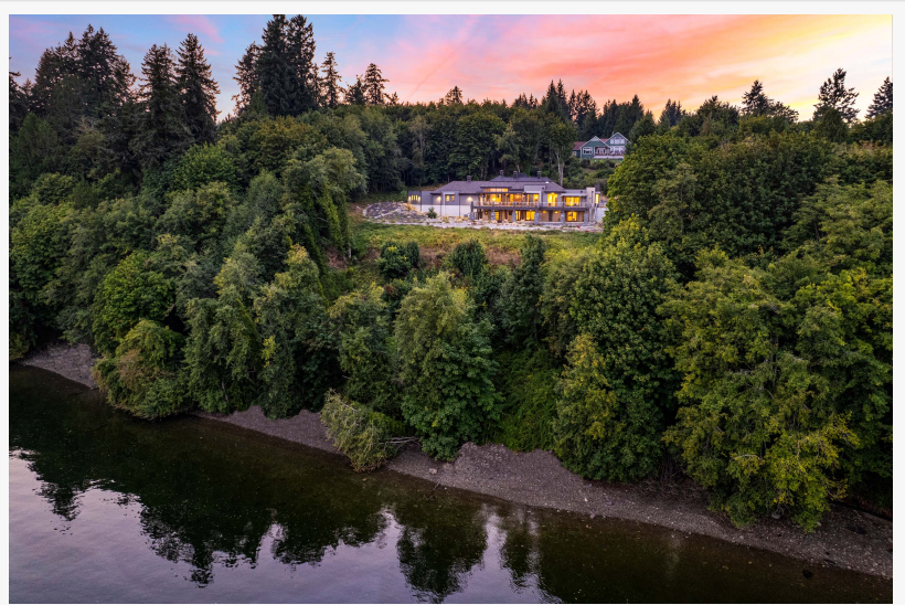
Estate on Puget Sound | Shelton, Washington

lakeside living. Views of the lake and grounds enrich indoor and outdoor spaces, ideal for entertaining family, friends, or clients. Inside, discover stone floors and high ceilings with exposed beams. The kitchen flows into the family room, connecting to the negative edge pool, lagoon, and Lake Austin. The main-floor primary suite offers privacy with custom window coverings on remote control, lake views, study access, private garage, and spa-like bath. Enjoy the media room with state-of-the-art-equipment, upstairs game room, or boat and wake