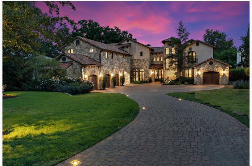
2611 Westlake Drive | Austin, Texas

Discover an expansive property with world-class equestrian facilities Near Aspen, CO; entertain from a lake-front estate featuring a private pool and lagoon, just 10 minutes from Downtown