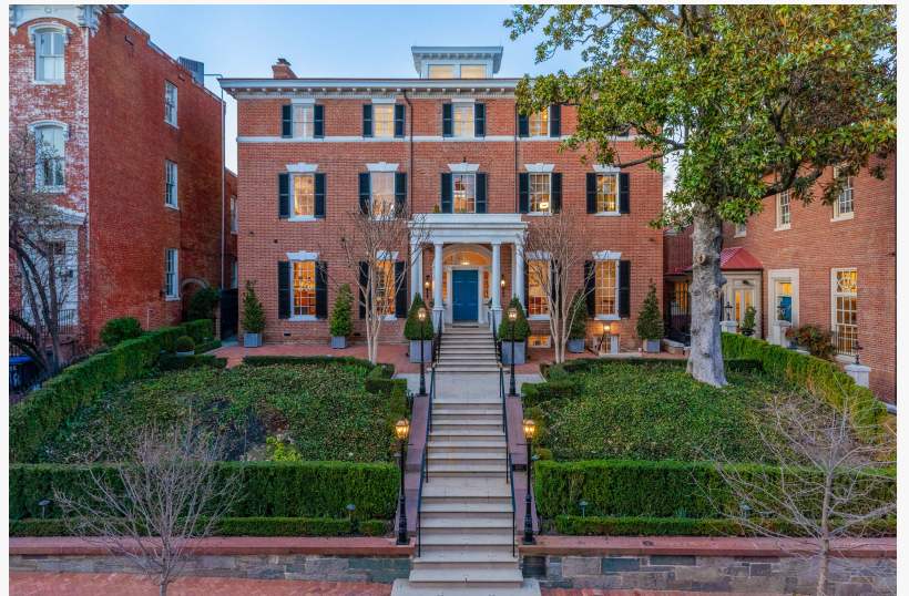
Historic Georgetown Estate | Washington, District of Columbia