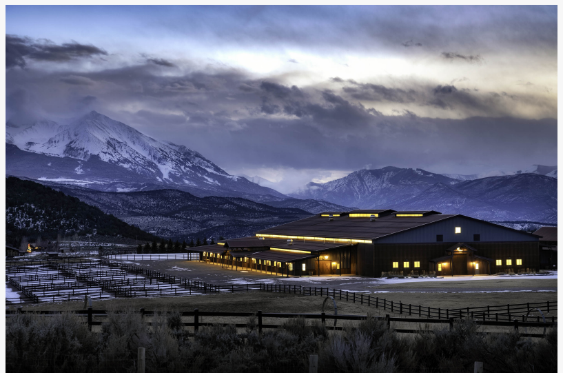
The Red Barn | Aspen Area, Carbondale, Colorado

Integrated within Sotheby's Hong Kong Autumn sale series —displayed and sold alongside exceptional offerings of fine art, jewelry, watches, designer handbags, and more. As the firm's first live sale in Hong Kong, properties included represent some of the finest Sotheby's International Realty offerings in the world.